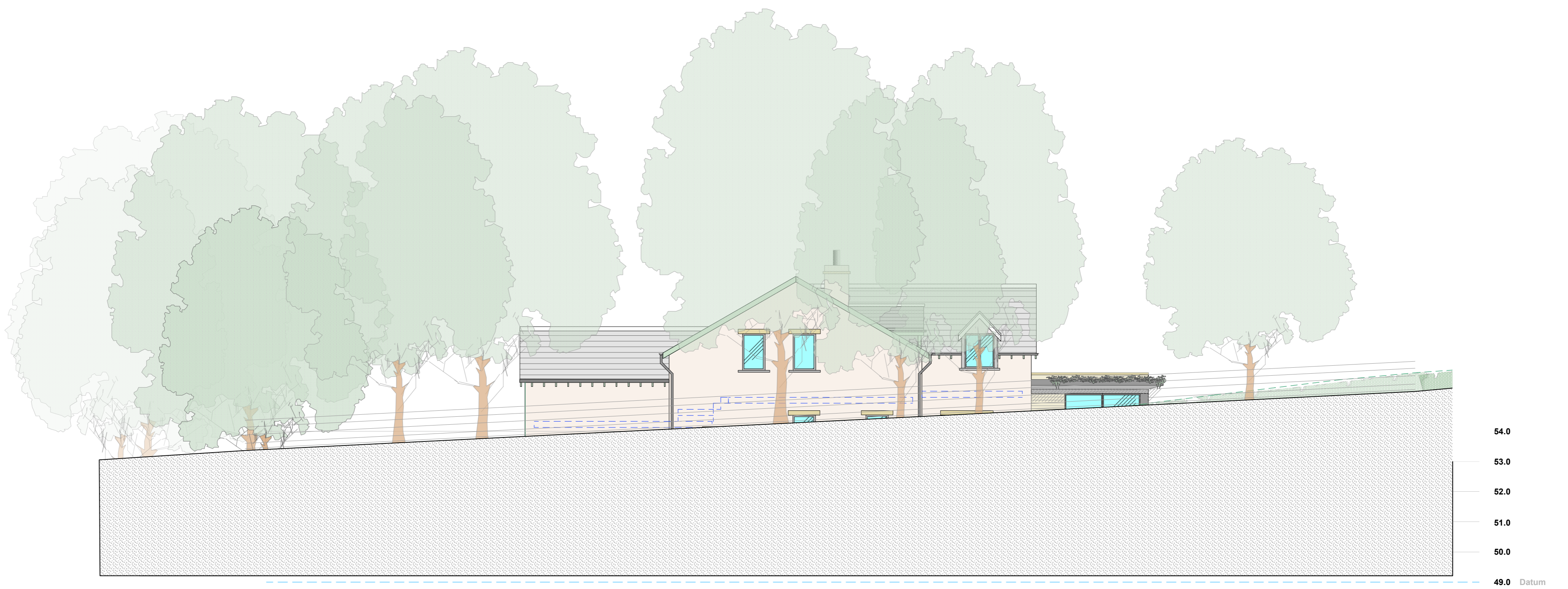
West Elevation Scale: 1:100