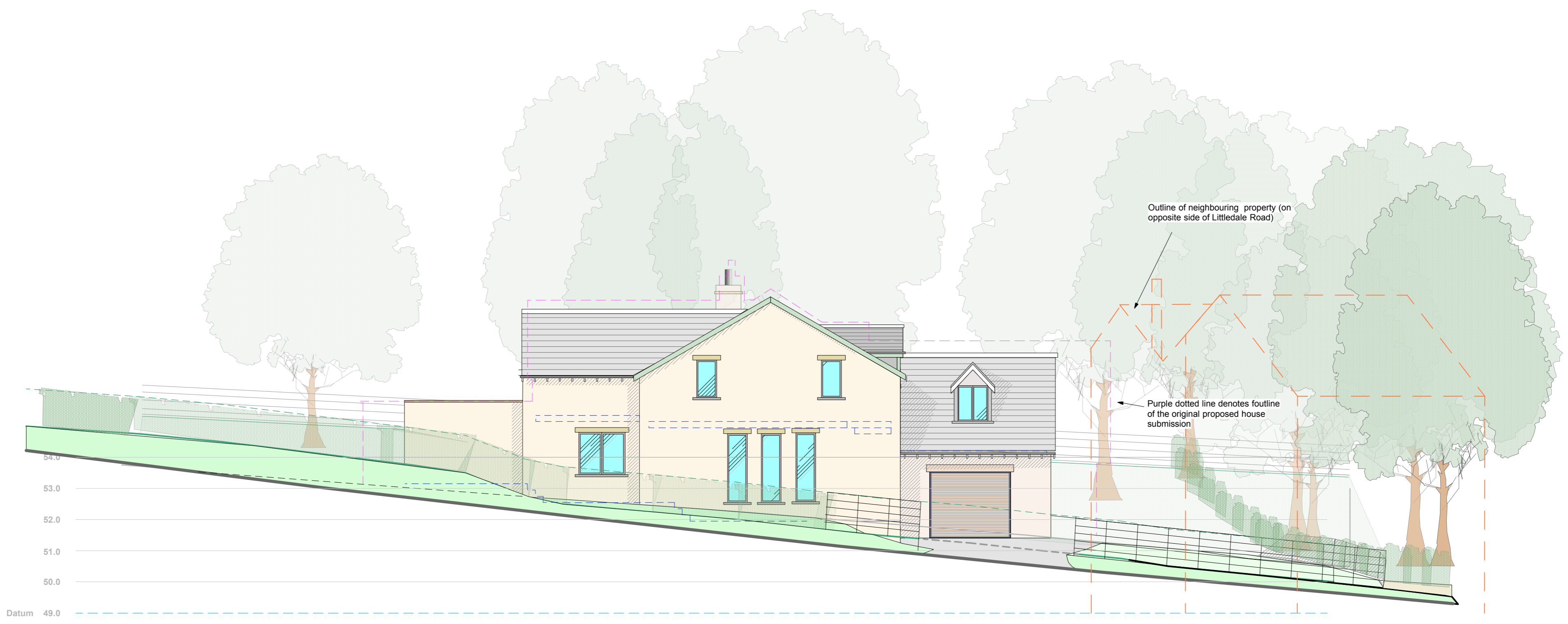
East Elevation Scale: 1:100